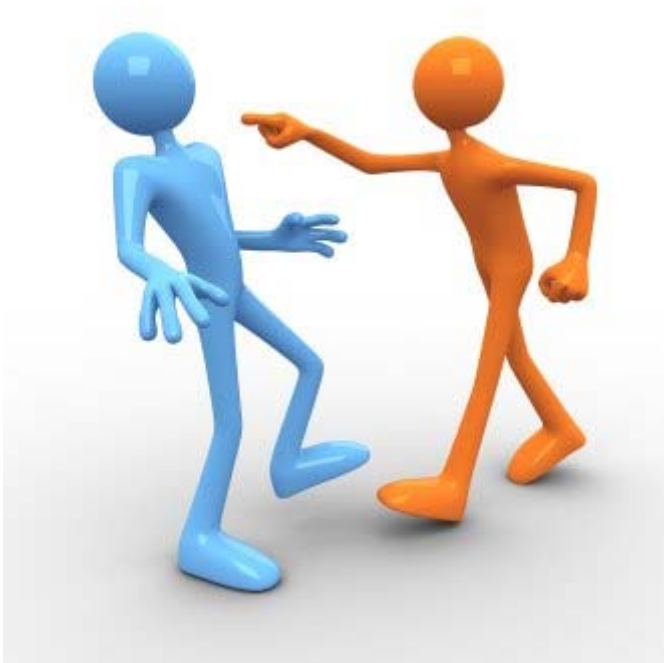
Antimobbing networks - employees demand